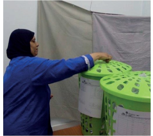
Pictured: Blue Skies Egypt recently held elections to select people to form their welfare and stakeholder committees.