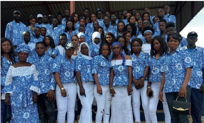
Pictured: The team from Blue Skies Senegal get together on their last day of production to celebrate the end of the season.