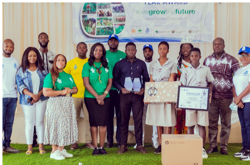
Pictured: Winning students and teachers from Obaa Nao St. Fidelis Senior High School

to stimulate a renewed appreciation in the importance of agriculture among young people in Ghana. Congratulations to everyone who took part in this year's competition. The winners were announced at a ceremony in Koforidua on the 26th of November.