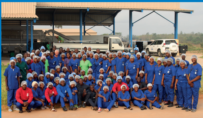
Pictured above: the team at Blue Skies Benin pose for a group photograph outside the new factory