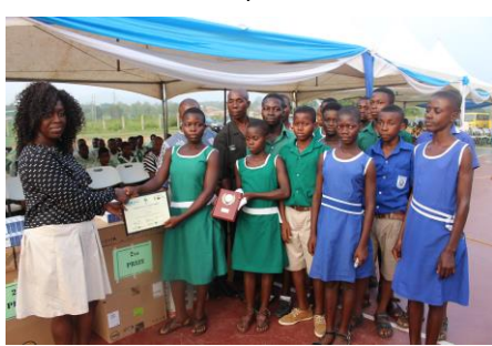
Junior 1st runner-up - Domponiase Basic