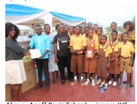
Above: Anoff Basic School, winners JHS School Farm of the Year