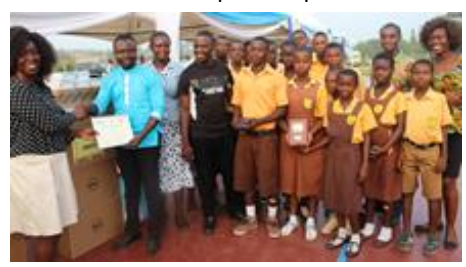
Junior First Prize - Anoff Basic School