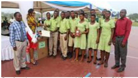
Senior 1st runner-up - Yilo Krobo SHS