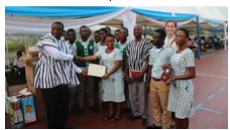
Senior First Prize - Manya Krobo SHS